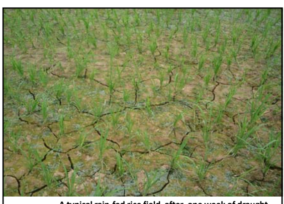
A typical rain-fed rice field after one week of draught